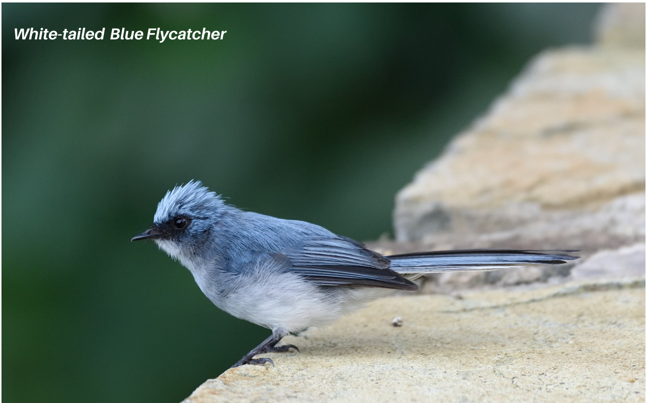
White-tailed Blue Flycatcher

After some morning birding, much of the remainder of today will be a travel day as it is nearly a 4-hour drive to Masindi in northwestern Uganda, where we will base for two nights. Birding opportunities on the drive are somewhat limited as we will pass through mostly degraded habitats that have been converted to agriculture. In order to arrive in Masindi in time for some late afternoon birding, we will plan for an early departure and carry a packed lunch. However whatever time we end up with today will be limited and our major efforts to find the area's birds will be on the following day. Night in Masindi.